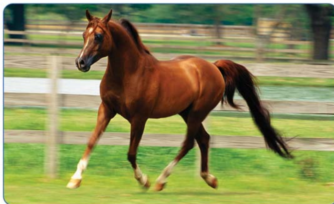
► Figure 1 We can tell this horse is moving because we see it pass by objects that are not moving—fence posts. The fence posts are our reference points.